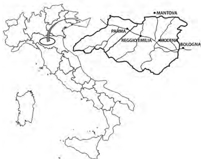
Figure 2. PR area of production as defined in the code of specifications